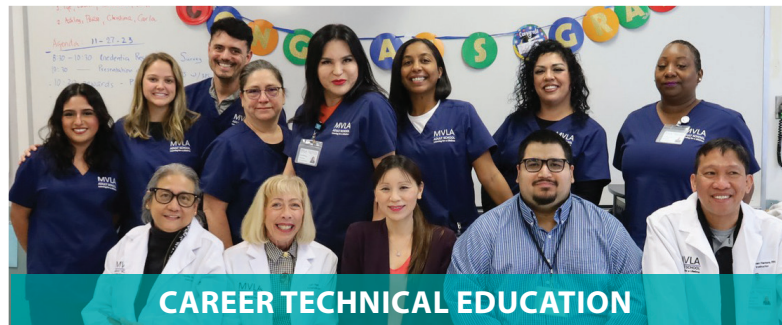
CAREER TECHNICAL EDUCATION