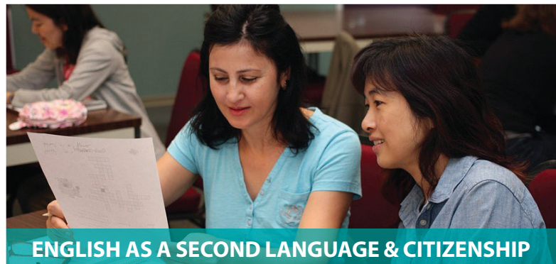
ENGLISH AS A SECOND LANGUAGE & CITIZENSHIP