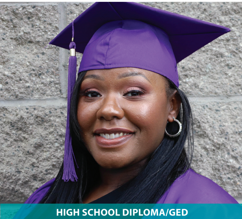
HIGH SCHOOL DIPLOMA/GED